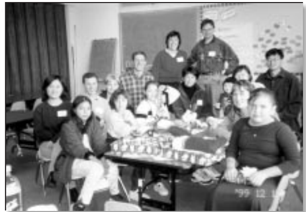
Middle School Girls Bible Club and volunteers

Our mission at BCM talks about making youth future leaders in the community and in the ministry. It is greatly encouraging to see this junior high Bible Clubber desire to take leadership in ministering to her peers.