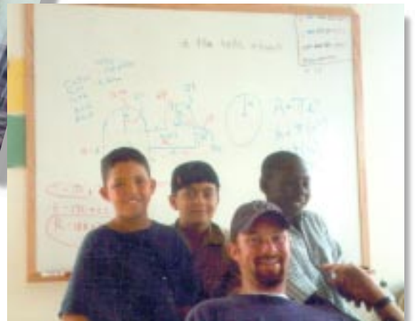
Boys in SAIL proudly display their advanced math set.